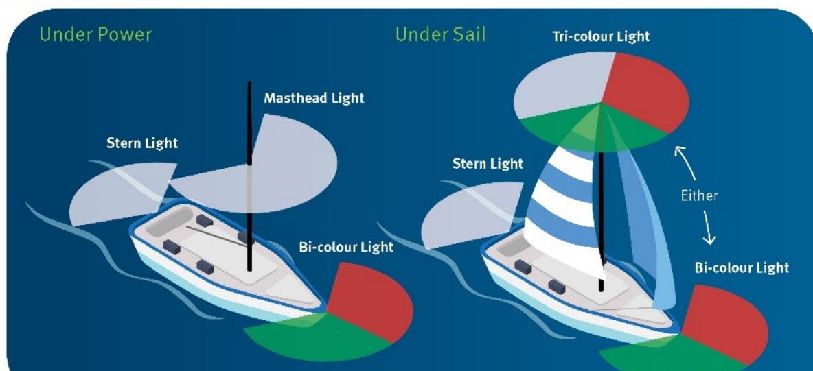
Figure 2 - Sailboat Navigation Light Requirements - Under Power and Under Sail