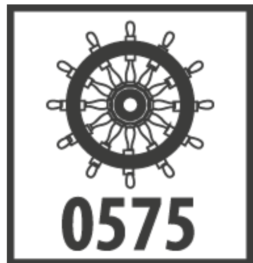
Figure 1 - MED 'Wheelmark'