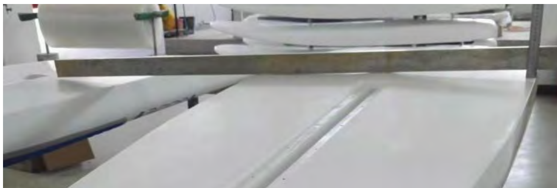
V – Inspection.