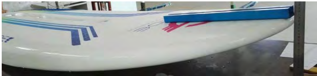
Rocker Height Inspection