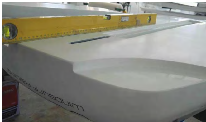
Flatness / Shape inspections