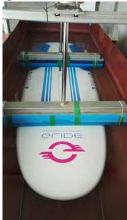
Water Tank Test