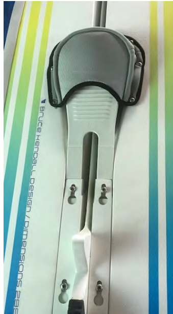
Stomp Pad + Cover

c) - Any Brochure or marketing material.