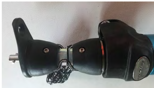
j) TENDON BASE