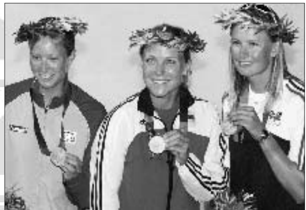
Single-handed Dinghy Women (Europe) medallists, left to right - Signe LIVBJERG (DEN) - bronze, Siren SUNDBY (NOR) - gold, Lenka SMIDOVA (CZE) - silver.

The 2004 Olympic Games was the final appearance for the time being for the Europe, as in November 2004 ISAF selected the Laser Radial as the equipment for the Single-handed Dinghy Women event for the 2008 Olympic Sailing Competition in Beijing, China.