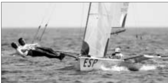
Iker MARTINEZ & Xabier FERNANDEZ (ESP) - double-handed dinghy open, 49er - 2004 Olympic gold medallists, 2004 49er World Champions and ISAF Rolex World Sailor of the Year nominees.

The Committee discussed the various classes proposed for selection as equipment at the 2008 Olympic Sailing Competition and provided comments on the reports from the Sailing and Events Committees.