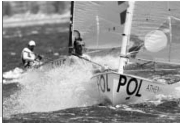
Mateusz KUSZNIEREWICZ (POL) - never out of the top two of the ISAF World Sailing Rankings in the Finn during 2004.