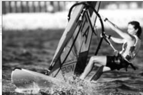
Alessandra SENSINI (ITA) - 2004 Mistral World Champion also entered the Olympic record books when she claimed her third Olympic medal after winning the bronze medal in Athens, Greece.

In the past few years there has developed within ISAF a great teamwork between the different committees and members. Thanks go to the President, Vice-Presidents and Council Members who have enabled the Women's Sailing Committee's successes by helping to overcome the many different obstacles along the way to these achievements. For some members these achievements have been very hard and thanks are due on behalf of Women's Sailing worldwide for the generosity of spirit.