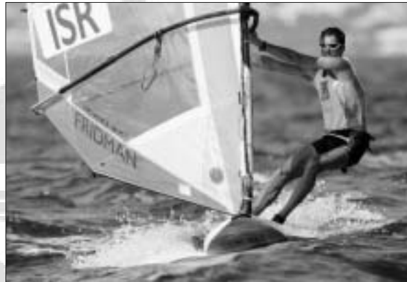
Gal FRIDMAN (ISR) - men's windsurfer, Mistral - 2004 Olympic gold medallist, the first person to ever win an Olympic gold medal for Israel in any sport and ISAF Rolex World Sailor of the Year Awards nominee.

was instigated with the manufacturer and class to overcome these problems, and the Class Rules were modified to make the Mistral a pure Manufacture Control Class. This work resulted