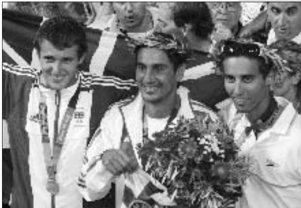
Windsurfer Men (Mistral) medallists - left to right - Nick DEMPSEY (GBR) - bronze, Nikolaos KAKLAMANAKIS (GRE) - silver, Gal FRIDMAN (ISR) - gold.

Glory in the final race went to Nick DEMPSEY (GBR), who with it proved that anything is possible by winning the race and claiming what seemed to be the unattainable bronze medal. DEMPSEY's medal was also the first Olympic windsurfing medal to be won by a British sailor.