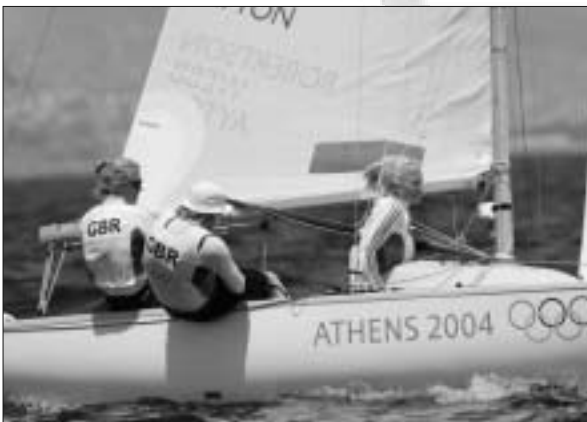
Shirley ROBERTSON, Sarah WEBB & Sarah AYTON (GBR) - women's keelboat, Yngling - 2004 Olympic gold medallists and ISAF Rolex World Sailor of the Year Awards nominees.