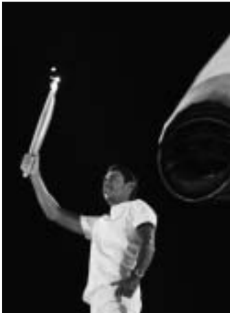
Nikolaos KAKLAMANAKIS (GRE) lights the Olympic flame at the 2004 Olympic Games Opening Ceremony in Athens, Greece on 13 August 2004.

Sixteen days later at the Closing Ceremony on Sunday 29 August the flame of the XXVIII Olympiad was extinguished by recently crowned gold medallists Sofia BEKATOROU and Emilia TSOULFA (GRE). The first time in the history of the Olympic Games that sailing has been honoured in this way.