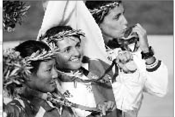
Windsurfer Women (Mistral) medallists - left to right - Yin JIAN (CHN) - silver, Faustine MERRET (FRA) - gold, Alessandra SENSINI (ITA) - bronze.

The Windsurfer Women (Mistral) fleet also boasted the youngest sailor at the Olympic Games and the only sailor from Latvia. At the age of 17 Blanca MANCHON (ESP) finished eighth overall whilst Vita MATISE (LAT) finished 20 overall.