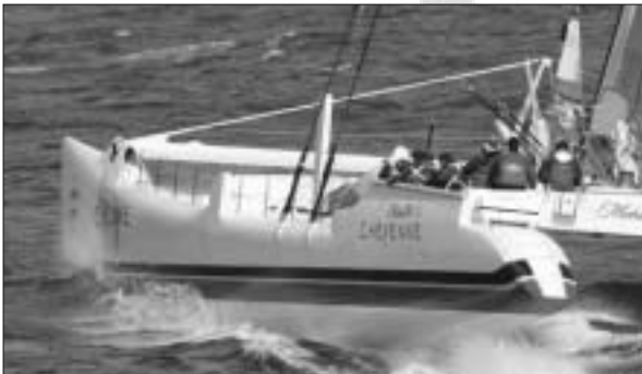
Steve FOSSETT (USA) - smashed the WSSRC Round the World Record with his crew on Cheyenne in a time of 58 days, 9 hours, 32 minutes and 45 seconds and was subsequently nominated for the male ISAF Rolex World Sailor of the Year Award.

The Committee began work on developing a system for recognizing Empirical Handicapping Systems as there is currently not provision for recognition. The introduction of a guidelines system will enhance Empirical Handicapping, make it more visible within ISAF, ensure minimum standards, enhance professional management and obtain international