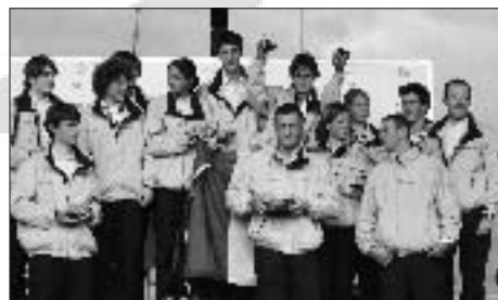
France - winners of the Volvo Trophy for the top performing nation at the Volvo Youth Sailing ISAF World Championship 2004.

Equipment was provided by Performance Sailcraft UK (Lasers), Nautivela - Italy (420s) and Hobie Cat Europe (Hobie 16s).