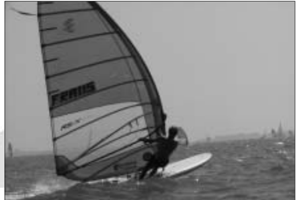
The Neil Pryde RS:X was selected as the men's and women's windsurfing equipment for the 2008 Olympic Sailing Competition at the ISAF Annual Conference.

The windsurfing events at the 2004 Olympic Sailing Competition in Athens were unique in the history of sailing. For the first time, a windsurfer, Nikolaos KAKLAMANAKIS (GRE), lit the Olympic torch at the opening ceremony and history was made in both the men's and the women's windsurfing events. Gal FRIDMAN won the first gold medal in any sport for Israel, Faustine MERRET became the first woman to win a medal for France and the first French sailor to win a medal in windsurfing when she won the gold medal and Nick DEMPSEY (GBR) also won the first windsurfing medal for his nation when he won the bronze in the men's event.