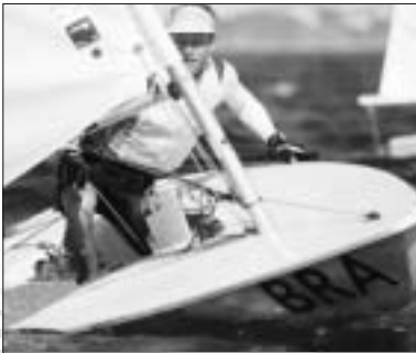
Robert SCHEIDT (BRA) - single-handed dinghy open, Laser - 2004 Olympic gold medallist, 2004 Laser World Champion for the seventh time and winner of the ISAF Rolex World Sailor of the Year male award.

Of particular interest to the ISAF classes