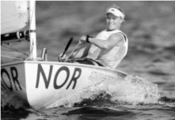
Siren SUNDBY (NOR) - single-handed dinghy women, Europe - 2004 Olympic gold medallist, 2004 World Champion, number one in the Europe Rankings for all of 2004 and ISAF Rolex World Sailor of the Year nominee.